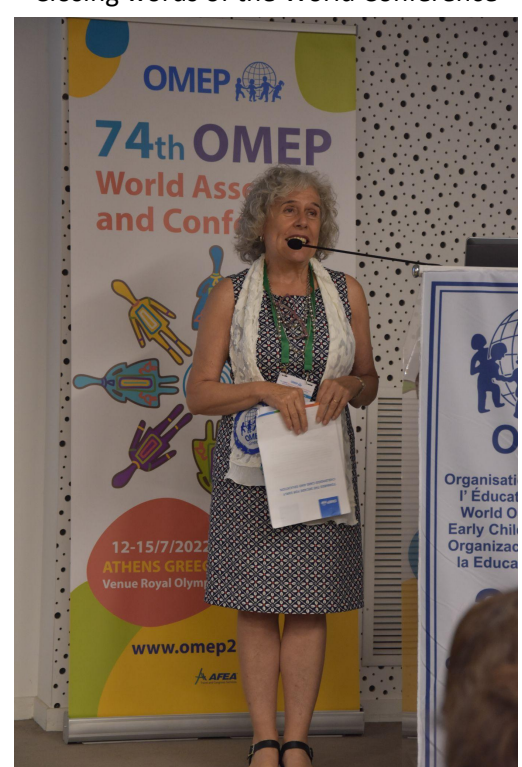
Closing words of the World Conference

The conference stood out for its academic and political quality and offered the participation of 8 relevant speakers. In addition, 193 free papers were presented in parallel sessions and 18 symposia were held on different topics. The Poster session had 43 presentations. The prizes for the Contest on Education for Sustainable Development and the New scholar award were also given out.