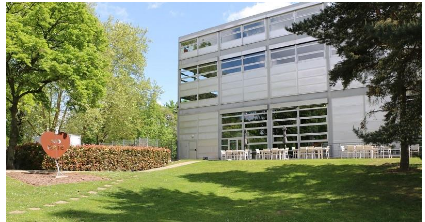
European Youth Centre Strasbourg