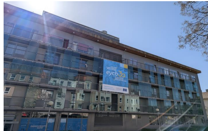
European Youth Centre Budapest